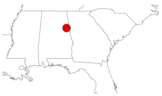
EXHIBIT B Davis Site Location Wedowee, Alabama