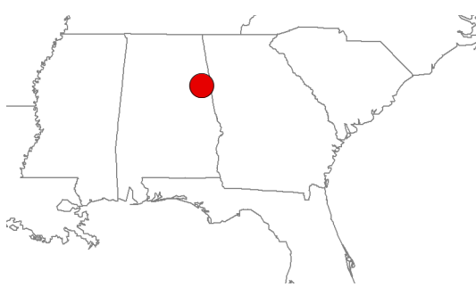
EXHIBIT A Davis Site Location Wedowee, Alabama